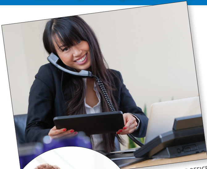
IN THE OFFICE